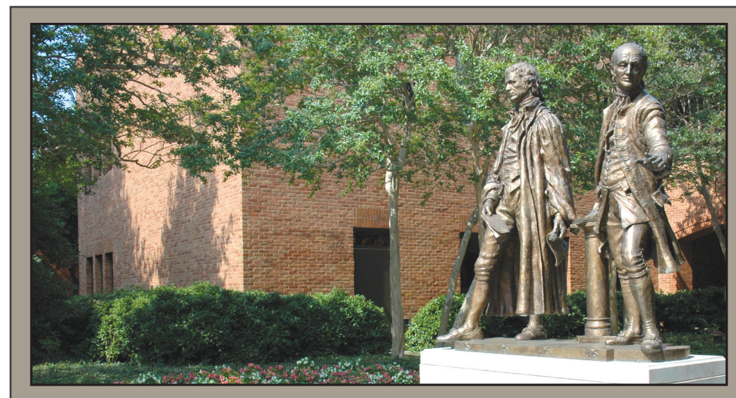
Statues in front of William & Mary Law School

George Wythe, at right, was William & Mary's - and the nation's - first professor of law. Chief Justice John Marshall, at left, was among the earliest law students at William & Mary.