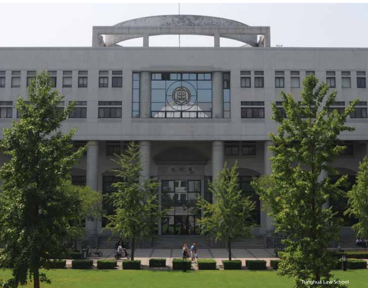
Tsinghua Law School