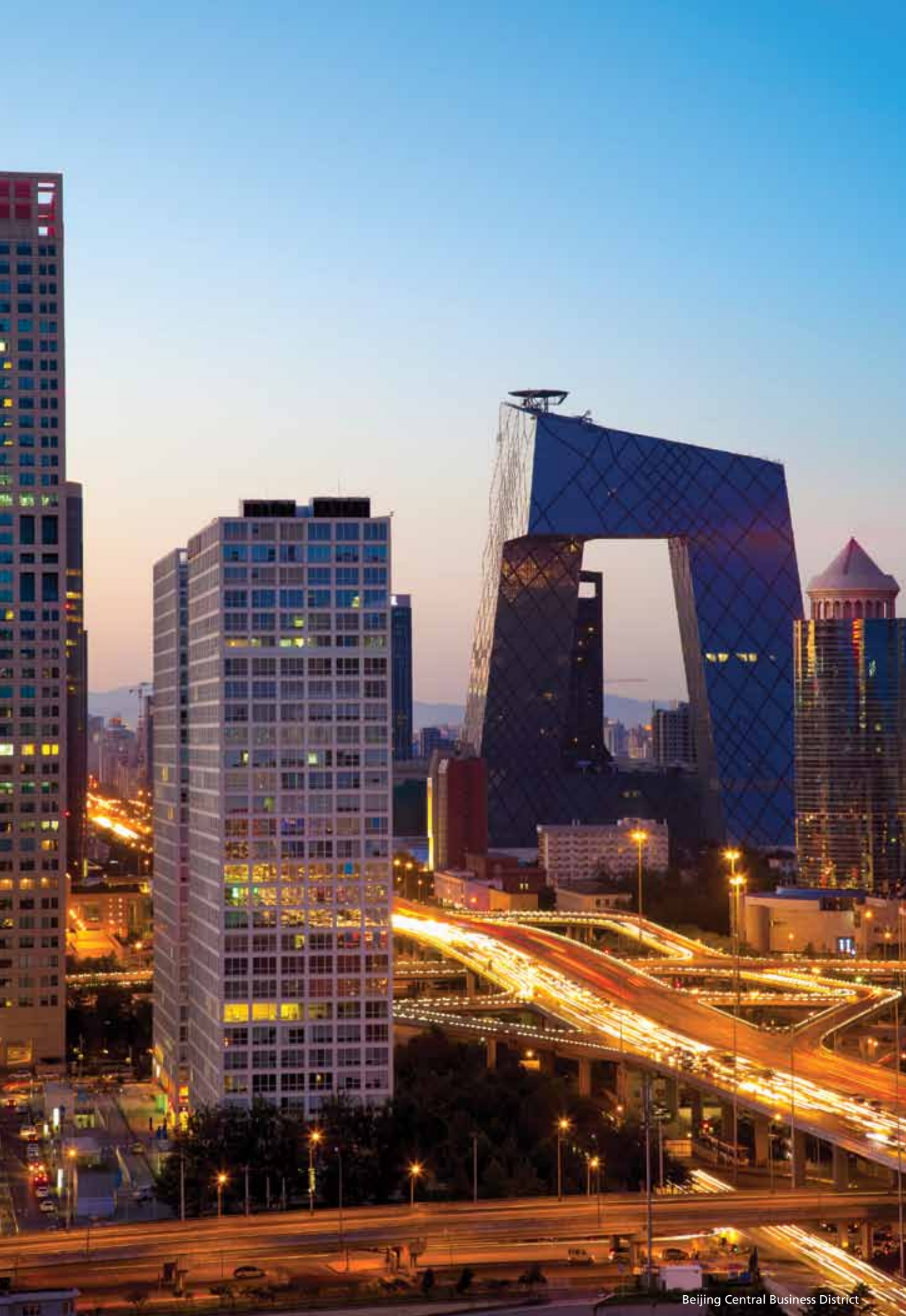
Beijing Central Business District