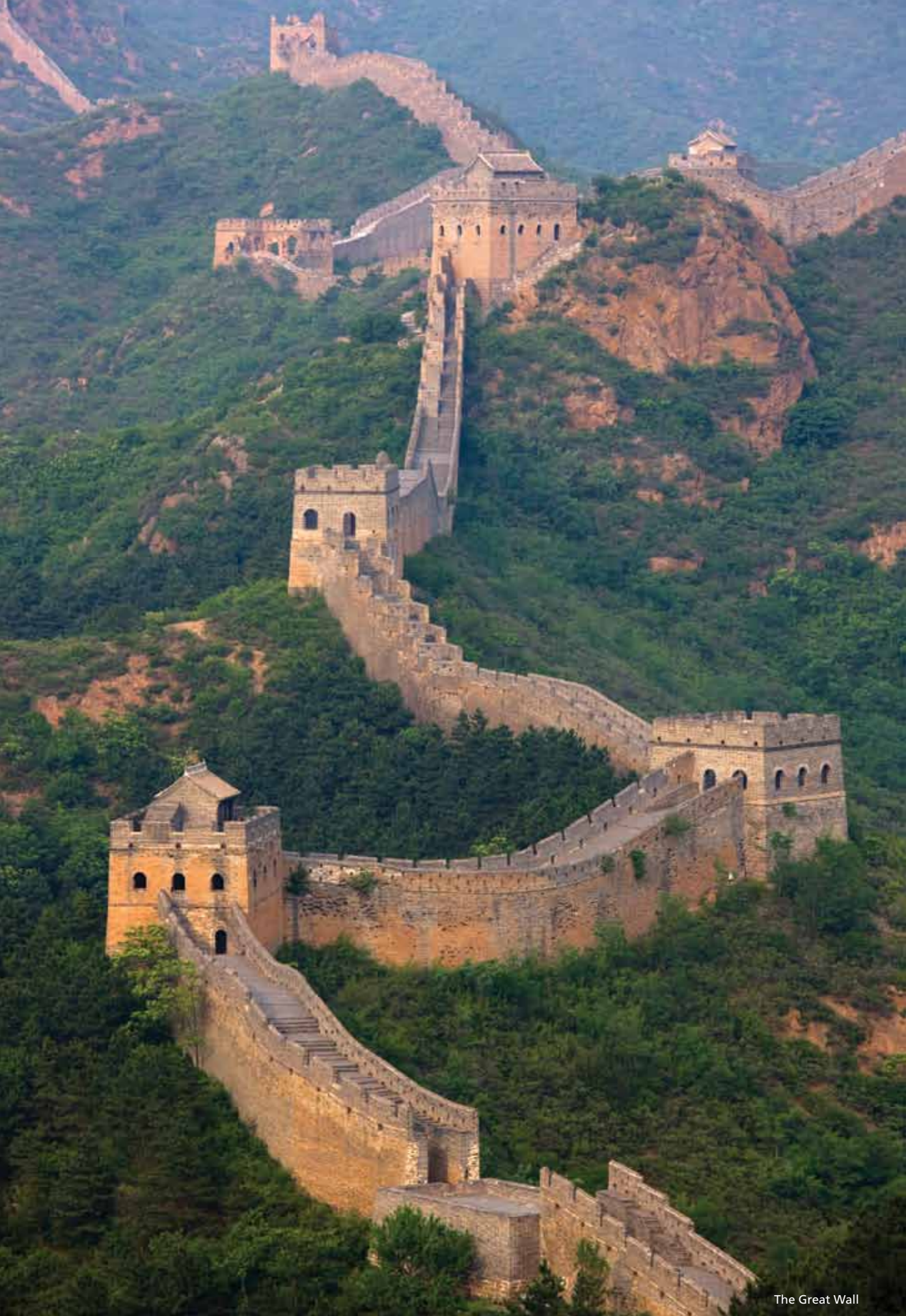
The Great Wall