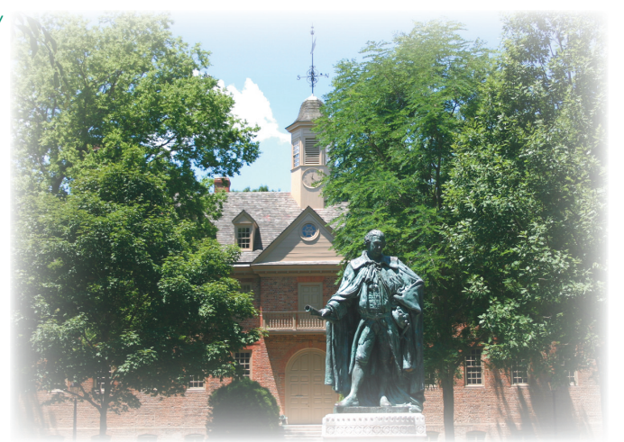
Wren Building, College of William & Mary